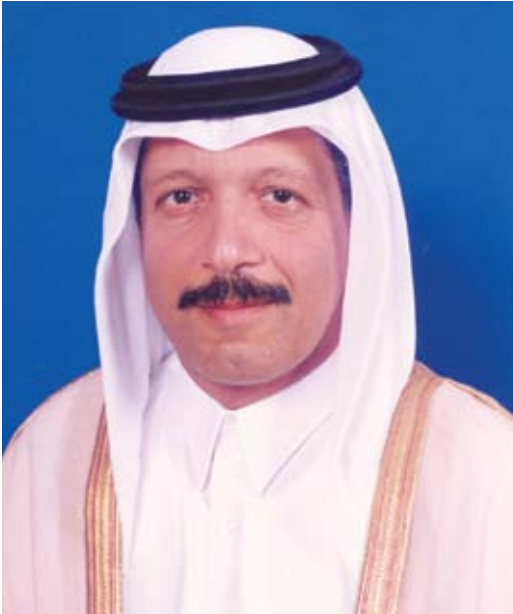
H.E. Yousef Hussain Kamal Minister of Economy and Finance Chairman of Qatar Steel