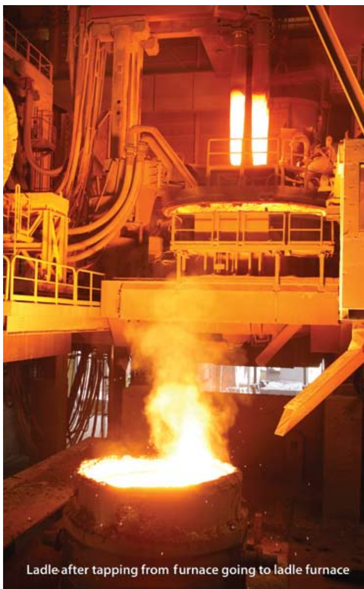
Ladle after tapping from furnace going to ladle furnace

RHI will supply the rapidly expanding enterprise with two more high-tech heat resistant gunning robots equipped with laser technology – an RHI innovation – for use in electric arc furnaces at temperatures of 1,500° Celsius, together with refractory products and services for other steel-making aggregates and applications. RHI's technological and product know-how has given Qatar Steel even more efficient, precise and safe ways of dealing with the refractory fittings in its aggregates. In addition, savings in maintenance time and repair materials and increases in productivity through improved plant availability are expected. The entire technology package will enable Qatar Steel to produce additional quantities of liquid steel every year.