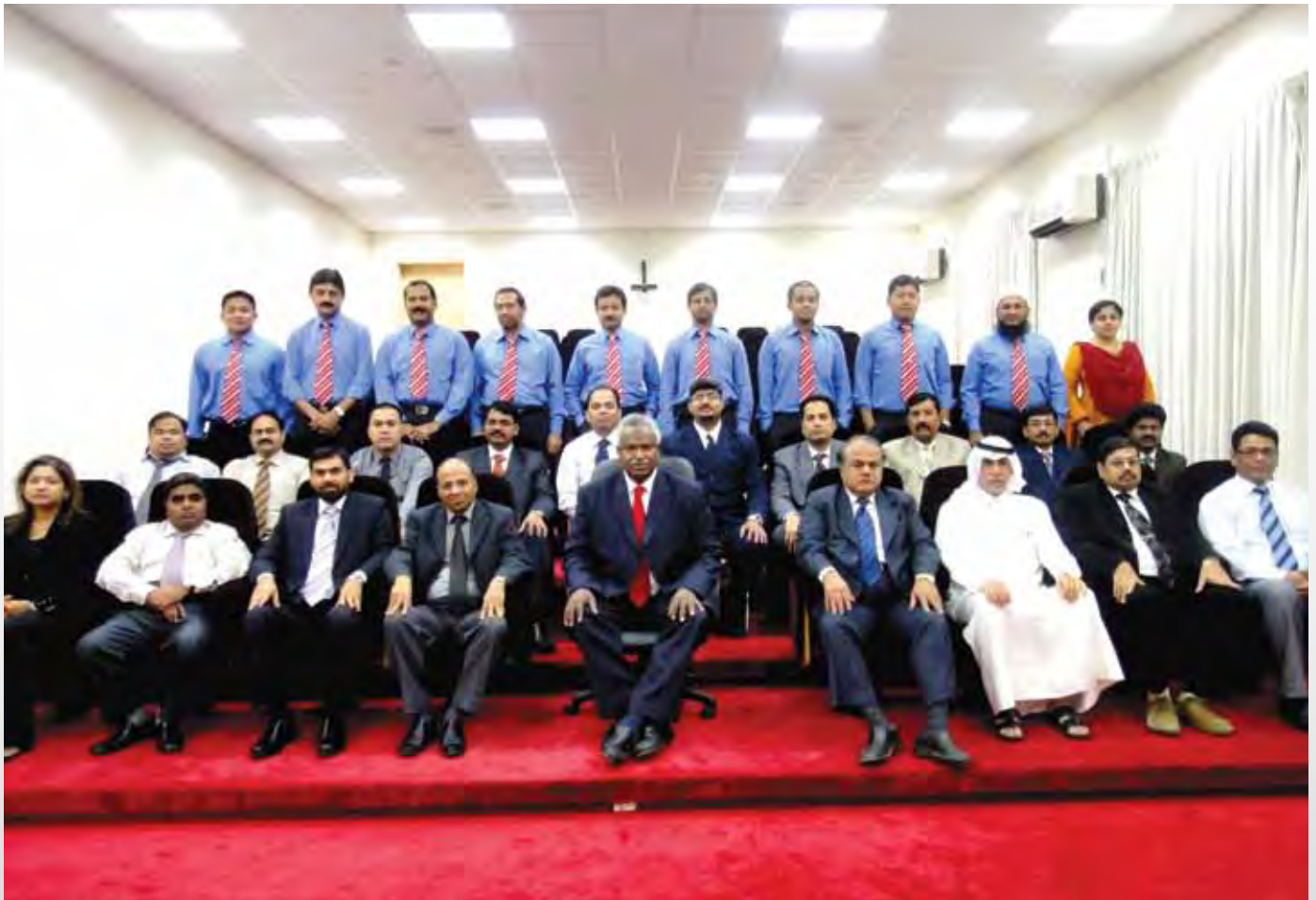
THE FINANCE DEPARTMENT'S WORKFORCE AS OF JUNE 2011

The Department is close to finalising a contract with a consultant to implement the Hyperion Planning and Budgeting software. This is expected to fundamentally change the budgeting process and will provide a strong reporting tool to set the basis for the Finance Dash Board.