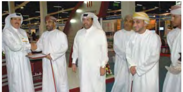
Infra Oman (20-22 September 2011)

Saudi Build (16-19 October 2011) - The 23rd International Construction Technology and Building Materials Exhibition provided contractors, real estate developers and building owners with a full range of building solutions. Saudi Build is the largest business construction fair in the Kingdom.