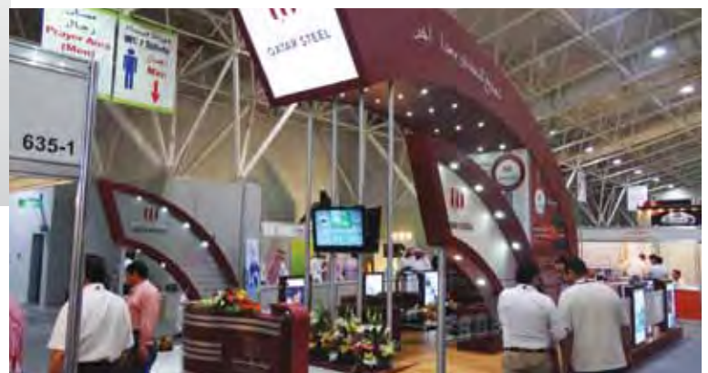
Saudi Build (16-19 October 2011)