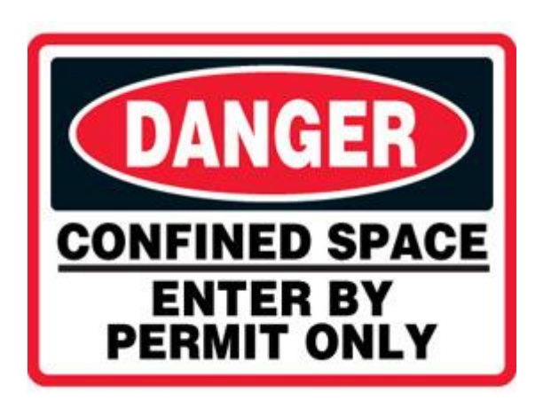
Figure 1: Confined Space signage permanently affixed to the vessel/tank

All Departments must demarcate the "Permit Required Confined Spaces" using a permanent label such as the attached image.