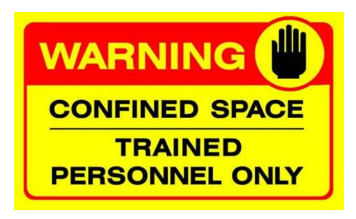
Figure 2: Warning sign to prevent unauthorized entry while CS entry work is being performed

The User Department will be responsible to post warning signs at all entry points into all Confined Spaces. Entry points shall be sign-posted with a danger sign forbidding entry to unauthorized personnel